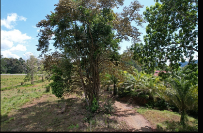
Grid power to the farm and even Asada water, though the farm also has eight internal springs as well as internal streams.