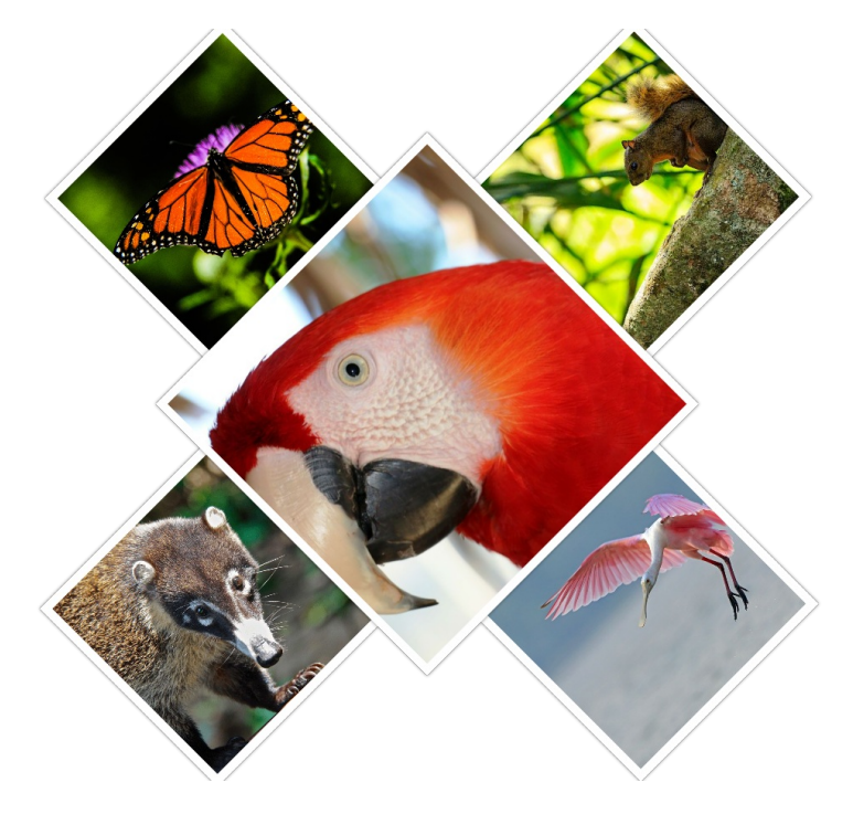
It is special to share family moments and create beautiful memories in this magical place.