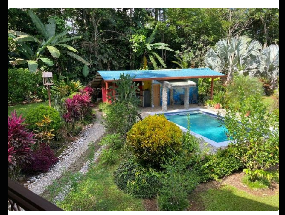
On the property there are two houses, fully available for immediate use \dots