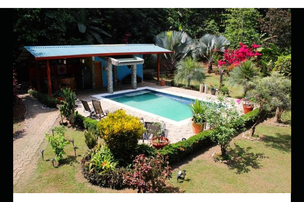
Call or write today for more information, to schedule your showing.