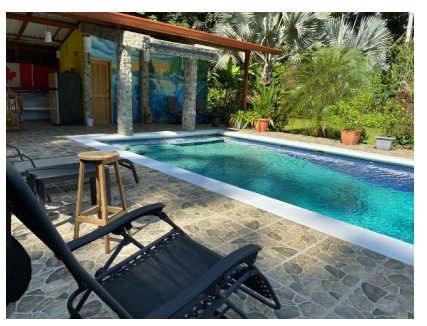
Imagine waking up every day and the first thing you do is breathe in the pure air of the mountains.