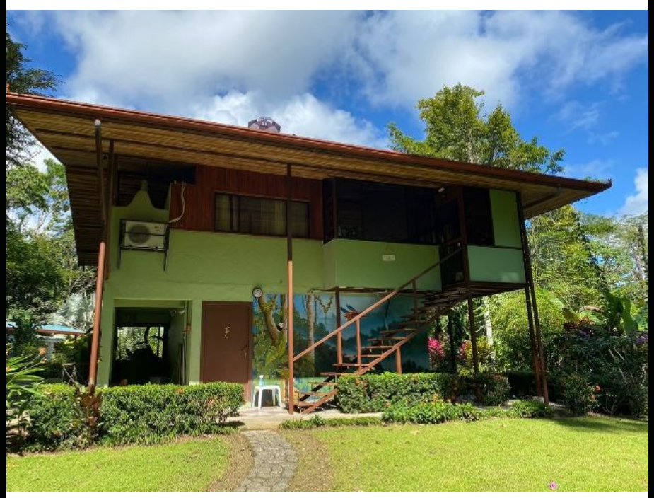
We enter the forest in the Cañaza area.

Located just 20 minutes from Puerto Jiménez.