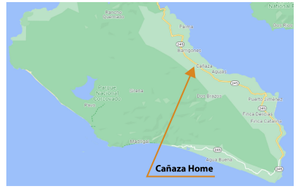
Subscribe to the Osa Pen Realty YouTube Channel <u>HERE!</u>

Paul Collar Osa Pen Realty: Your Key to Paradise! +506 8704-0027 land@osapenrealty.com