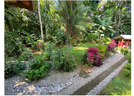
It includes 1.8 hectares in addition to having beautiful gardens around the property.