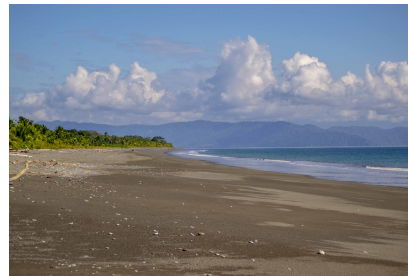
Lot # 2 FOR SALE!!!