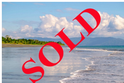
Lot # 3 SOLD!!!