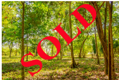
Lot # 1 SOLD!!!