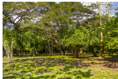
Lot # 4 FOR SALE!!!