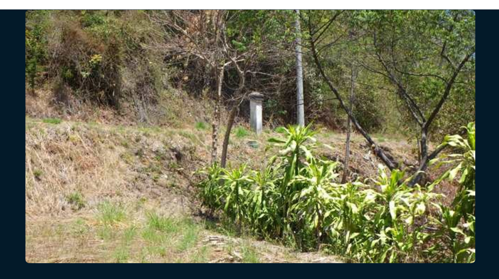
Don't delay on this one. Call or write to schedule your showing or to make an offer.