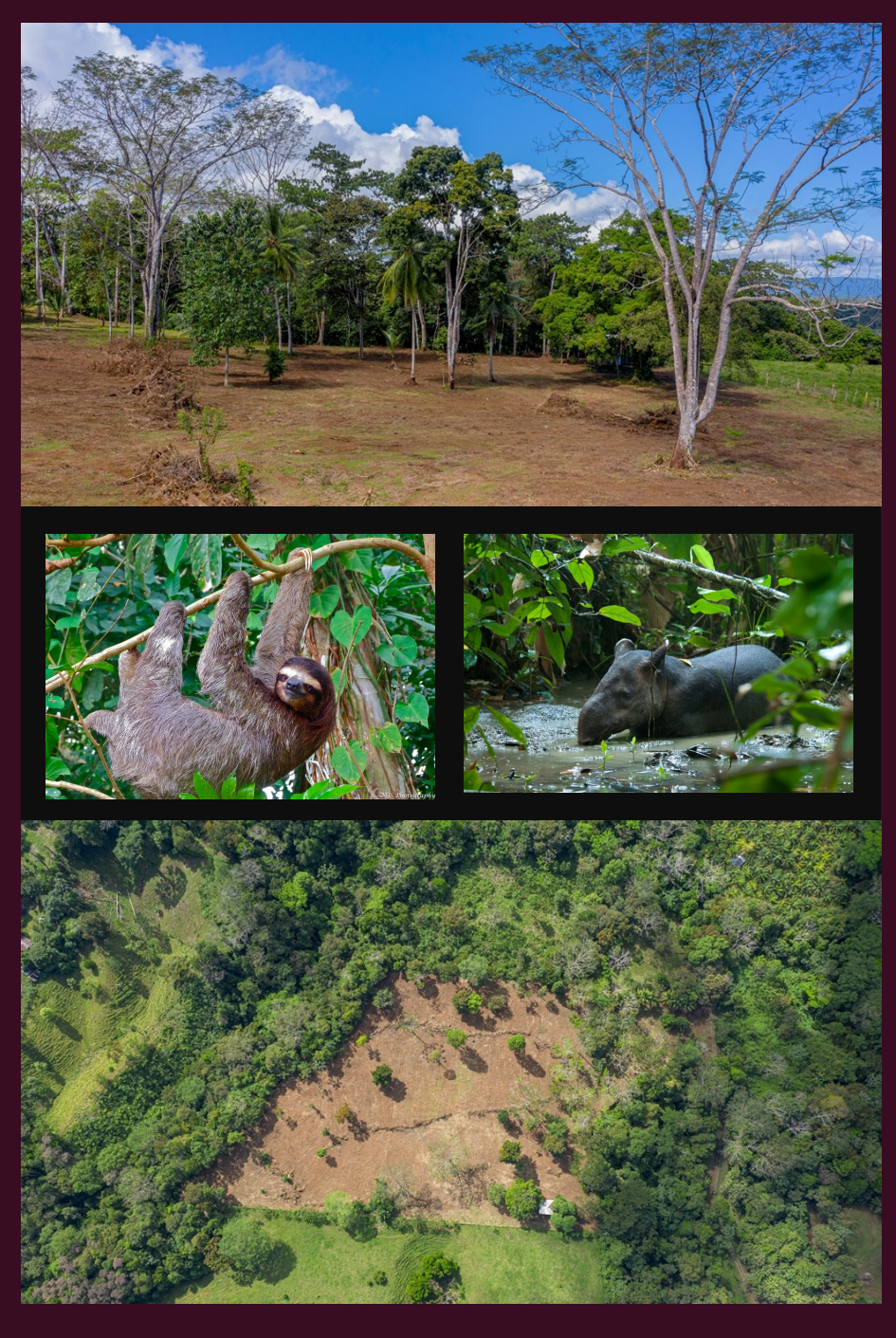
These lots are drawn out but not yet segregated, but with your purchase option segregation and title will take only a few weeks.